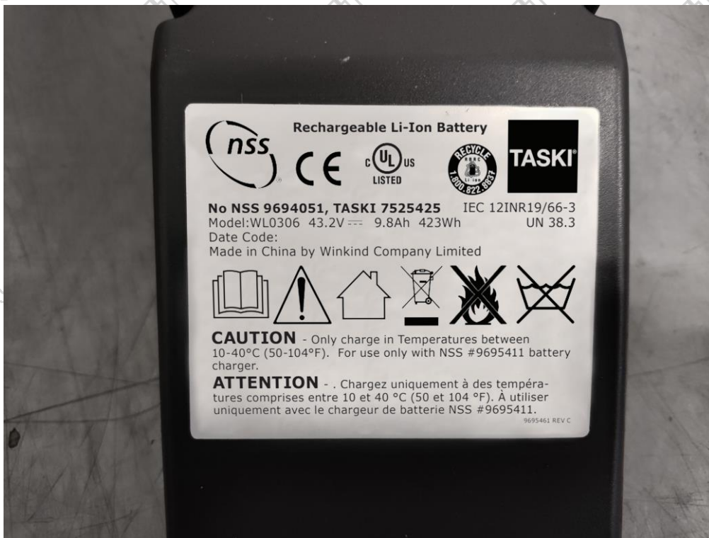
Figure 4 Battery Label (标签图)