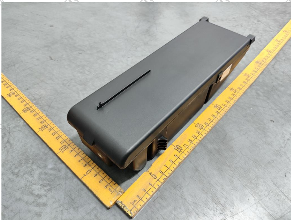
Figure 2 Overall view II of battery (电池外观图II)