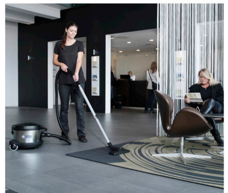
The new GD 930Q is specially built for noise sensitive areas with a low comforting background sound pressure level of only 42 dB(A)