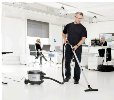
The GD 930 is the perfect choice for demanding applications such as offices, hotels and public buildings