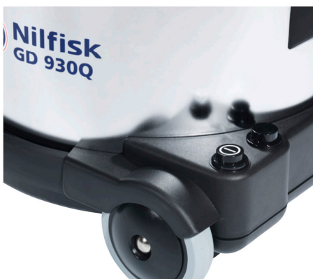
Dual speed function