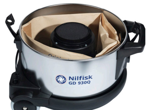
Durable steel container and 15 litre dust bag