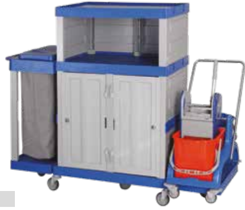
ART NO HLM 500 SCPD

3 X Strong Shelves With 90kg Loading Capacity, 100mm Wheels With Double Bearing, 120l Poly Bag With Zip, 2 Doors, complete 2x25l Moveable Double bucket Trolley With Downpress Wringer, Ergonomic Push handle With Groove.