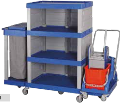
ART NO HLM 500 SCP

3 X Strong Shelves With 90kg Loading Capacity, 100mm Wheels With Double Bearing, 120l Poly Bag With Zip, Complete 2x25l moveable Double Bucket Trolley With Downpress Wringer, Ergonomic Push Handle With Groove.