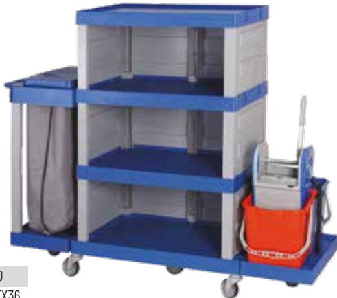
ART NO HLM 500 EX36

3 X Strong Shelves With 90kg Loading capacity, 100mm Wheels With Double bearing, 120l Poly Bag With Zip, 2x25l Double Bucket Trolley With down Press Wringer, Ergonomic Push handle With Groove.