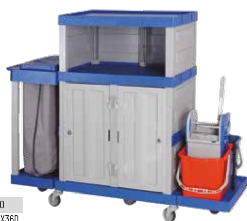
ART NO HLM 500 EX36D

3 X Strong Shelves With 90kg Loading capacity, 100mm Wheels With Double bearing, 120l Poly Bag With Zip, 2 Doors, 2x25l Double Bucket Trolley with Down Press Wringer, ergonomic Push Handle With Groove.