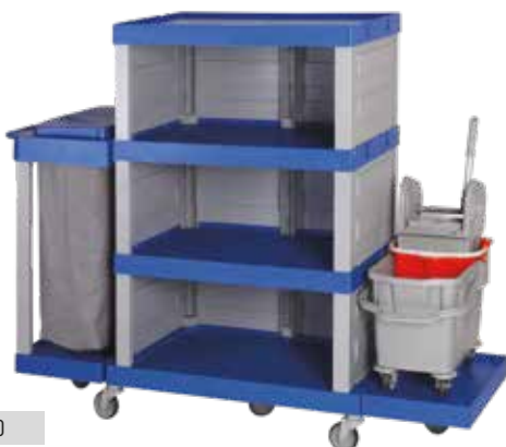
ART NO HLM 500 STE25

3 X Strong Shelves With 90kg Loading Capacity, 100mm Wheels With Double Bearing, 120l Poly Bag With Zip, 25l Ergo double Bucket Trolley With Downpress Wringer, Ergonomic Push handle With Groove.