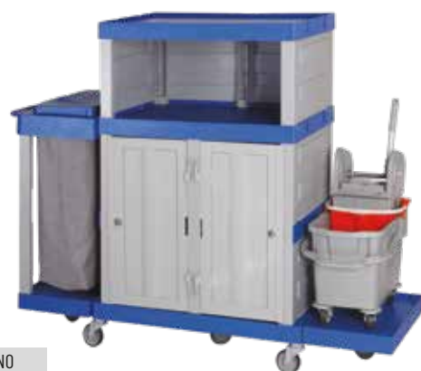
ART NO HLM 500 STE25D

3 x strong shelves with 90kg loading capacity, 100mm wheels with double bearing, 120L poly bag with zip, 2 doors, 25L Ergo Double Bucket Trolley with downpress wringer, ergonomic push handle with groove.